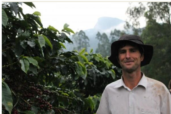
Nalli family farmer