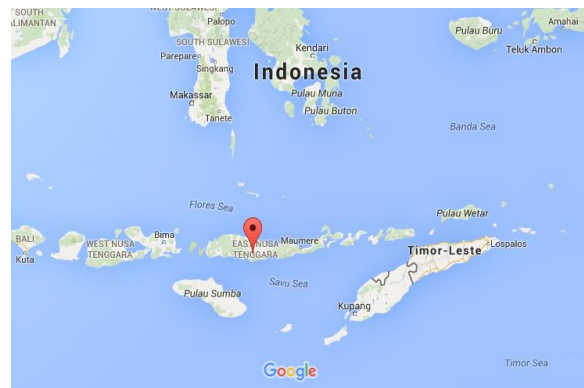
Ngada Regency, Flores, Indonesia