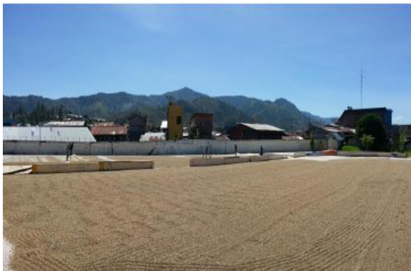
Drying patio in Aceh

Harvest: September – December, March - May