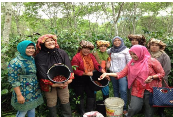
Ketiara Co-op farmers